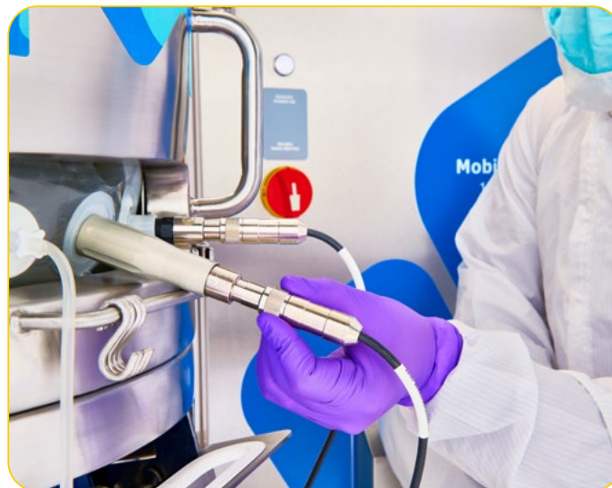
Figure 3. Sample port, single-use conductivity & pH probes

Every Mobius® Power MIX container includes needle-free sampling valves. The unique design of the sample device eliminates dead legs ensuring a representative sample while avoiding loss of valuable product. Using NovaSeptum® SURE single-use sterile sampling assemblies, a closed concept allows users to obtain a sample directly from the mixing container without the risk of cross contamination. Once a sample is obtained, the sample container is separated from the mixing container using the NovaSeal™ crimping tool that crimps the collar on the sample tube resulting in two closed, sterile ends. The NovaSeptum® SURE assemblies come as single or manifold designs in popular formats. They can also be customized to better fit sampling requirements.