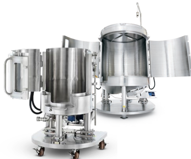
Figure 1. Mobius® Power MIX 2000 has double doors that open to one half the diameter of the carrier; the Mobius® Power MIX 100, 200, and 500 have a single door that opens to one half the diameter of the carrier.