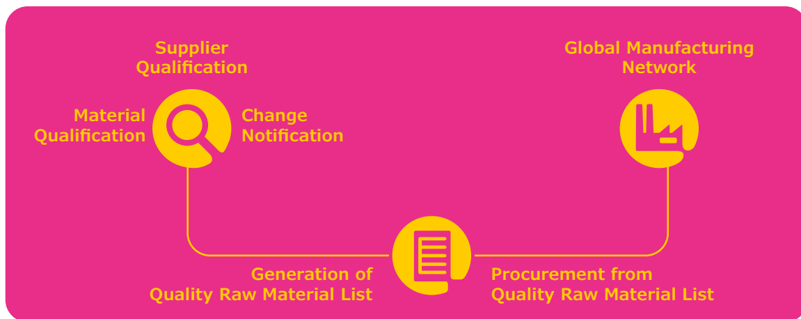
Figure 2. Procurement and inventory systems are managed locally as part of our global, unified supply chain management program.

Supplier qualification includes a requirement for transparency regarding source of materials, the process used to manufacture the material as needed, the country of origin, complete documentation and proactive change notifications. Material qualification includes extensive characterization of a number of lots, and those attributes which would be a risk for cell culture media like trace element impurities. Local procurement teams and inventory systems are integrated on a global basis to help minimize the potential for supply disruptions and allow us to share batches for raw materials between sites.