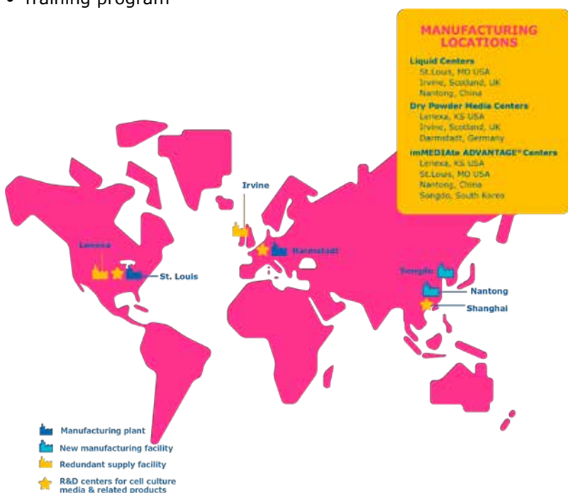
Figure 4. Our cell culture media manufacturing network

Each of our media facilities have on-site quality control laboratories. Standard quality control assays for media are conducted using harmonized current compendia methodologies. Other non-compendial assays require validation to ensure fit for use for cell culture media as shown in Table 1 .