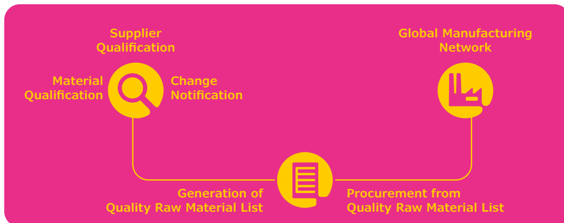
Figure 2. Our global raw materials vendor management program supports all of our manufacturing locations.

Our procurement experts purchase the same approved cell culture media raw materials, from the same qualified suppliers, for use at all our manufacturing sites. This gives you confidence that we're supplying high-quality products from any one of our manufacturing sites from all over the world.