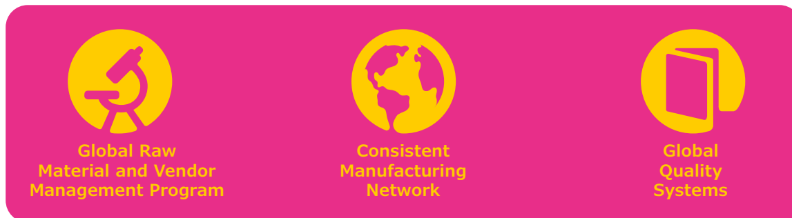
Figure 1. Our comprehensive cell culture media quality program is based on an integrated set of disciplines.

In this white paper, we highlight the breadth of programs implemented across our organization to safeguard the quality of the cell culture media that are used in our customer processes – from some of the world’s highest grossing biologics to those produced on a patient-by-patient basis such as breakthrough cell therapies. Our programs represent a set of integrated disciplines focused on raw material characterization in conjunction with global supplier quality management and advanced procurement and inventory systems ( Figure 1 ).