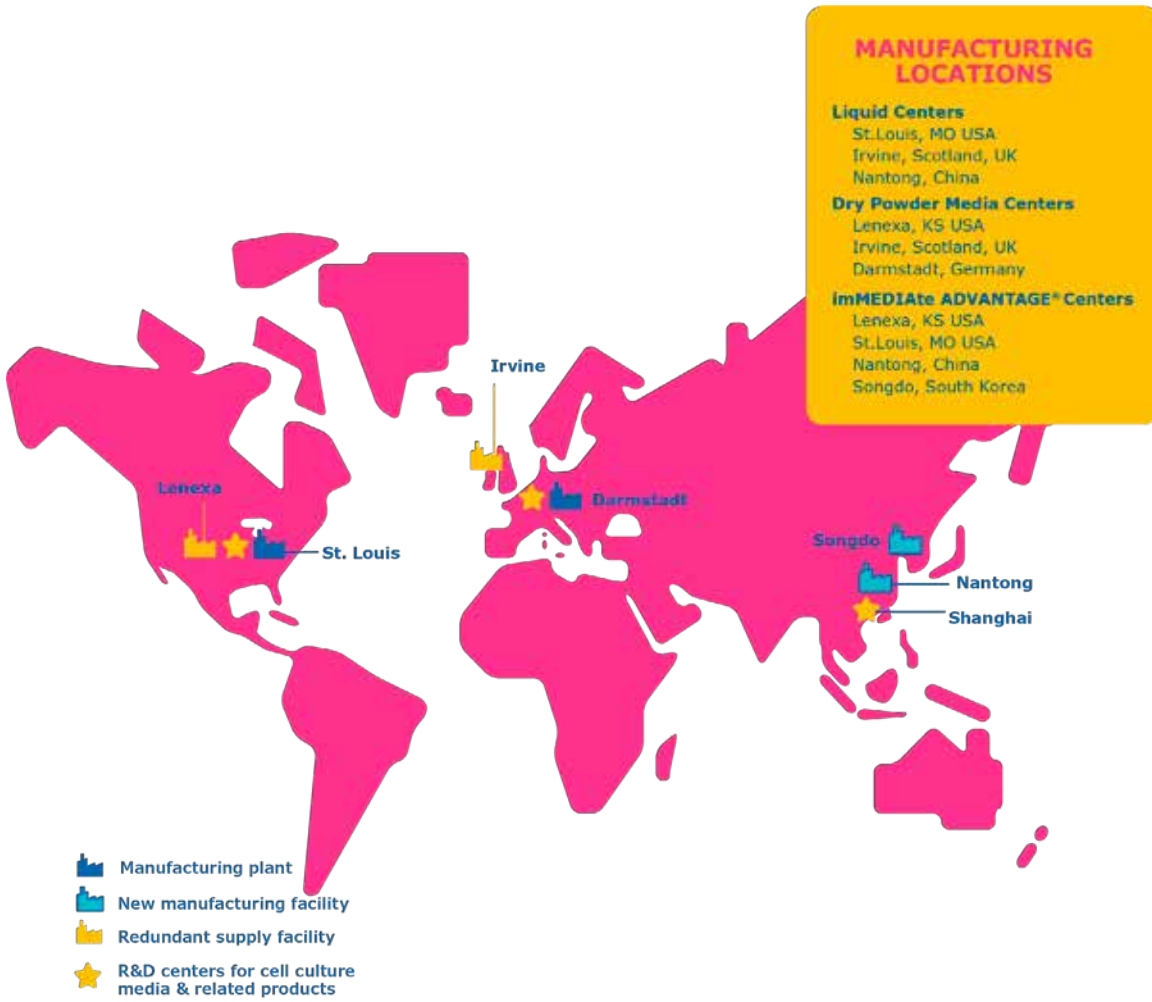
Figure 1. A manufacturing network with multiple sites for liquid and powder, all designed to deliver consistent quality product.