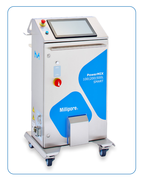
Figure 1. Smart control box

Recipe-driven automation eliminates manual operations, increases reproducibility, and minimizes risk of errors. Reports can be easily generated from scratch or from pre-defined templates. An interactive P&ID allows users to visually monitor the process and control each of the components from the Human-Machine Interface (HMI) or from anywhere through a browser-based interface.