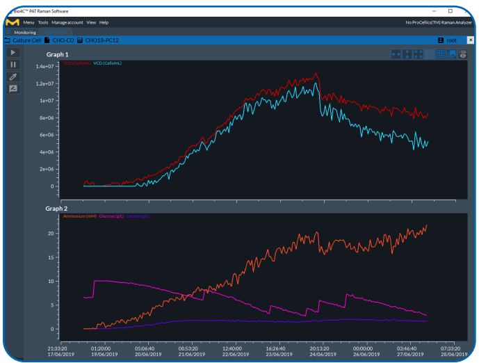
Figure 2: Real-time monitoring of a CHO cell culture (red: TCD, light blue: VCD, orange: ammonium, pink: glucose, purple: lactate).

The use of Raman spectroscopy to monitor process parameters first requires chemometric model building with a calibration dataset. In this study, Raman spectra from three independent culture runs were collected using the ProCellics™ Raman Analyzer, preprocessed by Bio4C™ PAT Raman Software and used to build chemometric models for TCD, VCD, concentration of glucose, lactate and ammonium. These models were used by the Bio4C™ PAT Raman Software for real-time monitoring of process parameters for a new cell culture run from the acquired Raman spectra (Figure 2).