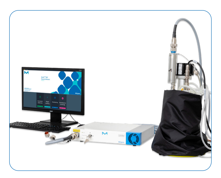
Figure 1: ProCellics<sup>™</sup> Raman Analyzer probe immersed into the bioreactor, protected from external straylight with a lightproof fabric. The instrument is controlled by Bio4C^{™} PAT Raman Software.